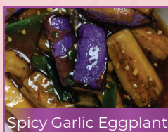
Spicy Garlic Eggplant