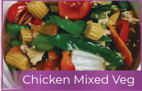
Chicken Mixed Veg