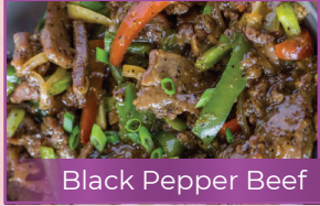
Black Pepper Beef