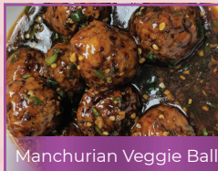
Manchurian Veggie Ball