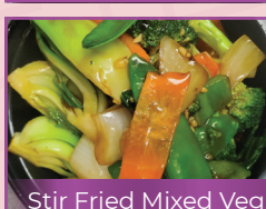
Stir Fried Mixed Veg.